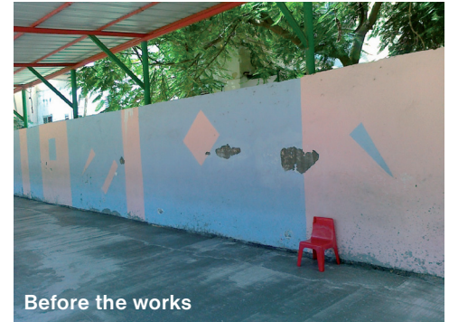
Before the works