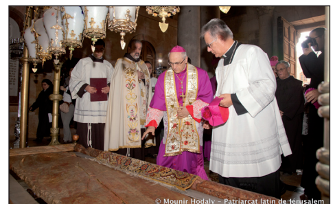
© Mounir Hadaly - Patriarcat latin de Jérusalem