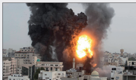
In hostilities between Israel and the Gaza Strip 173 Palestinians and six Israelis were killed, mostly civilians on both sides.

Patriarch Fouad Twal said that " a war is never holy ." He " totally condemns the option of war, violence and destruction that is a threat to the security and stability of the region ." The landscape of the Middle East proves it, very tense in this bloody autumn. Consider that in Syria there are already more than 40,000 deaths in 18 months of uprising; Lebanon is reeling under the accustomed effect of the its neighbors' problems; Israel is preparing to vote in January on the joint list of Likud and nationalist and religious parties, an alliance that condemns in advance the progress of the Palestinian issue. Palestinians are always divided between the West Bank headed by Fatah and the Gaza Strip, in the hands of Hamas. It is in this very tense context, where international impotence is stronger than ever