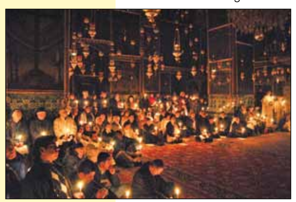
The theme for 2011 refers to the experience of the first Christian community in Jerusalem

The Week of Prayer for Christian Unity in Jerusalem was held on January 22 - 30. This year's theme in the West and East was prepared by the churches of Jerusalem with a quote from the the Holy See - "now offer a good view