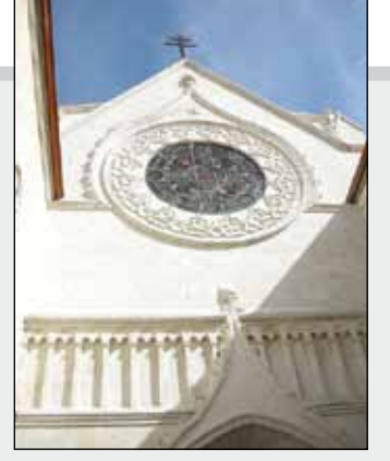
The Co-Cathedral of the Most Holy Name of Jesus, Chair of the Latin Patriarch of Jerusalem.

simple, it tells you about the Latin Patriarchate news on a monthly basis;