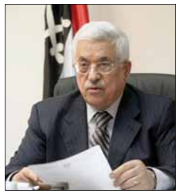
President of the Palestinian Authority commits to support Christian communities

The Patriarch thanked the President on behalf of all the Bishops present for his expression of support for Christians, for his message of confidence, and for making the Church representatives aware of the political projects of the Palestinian Authority for peace."