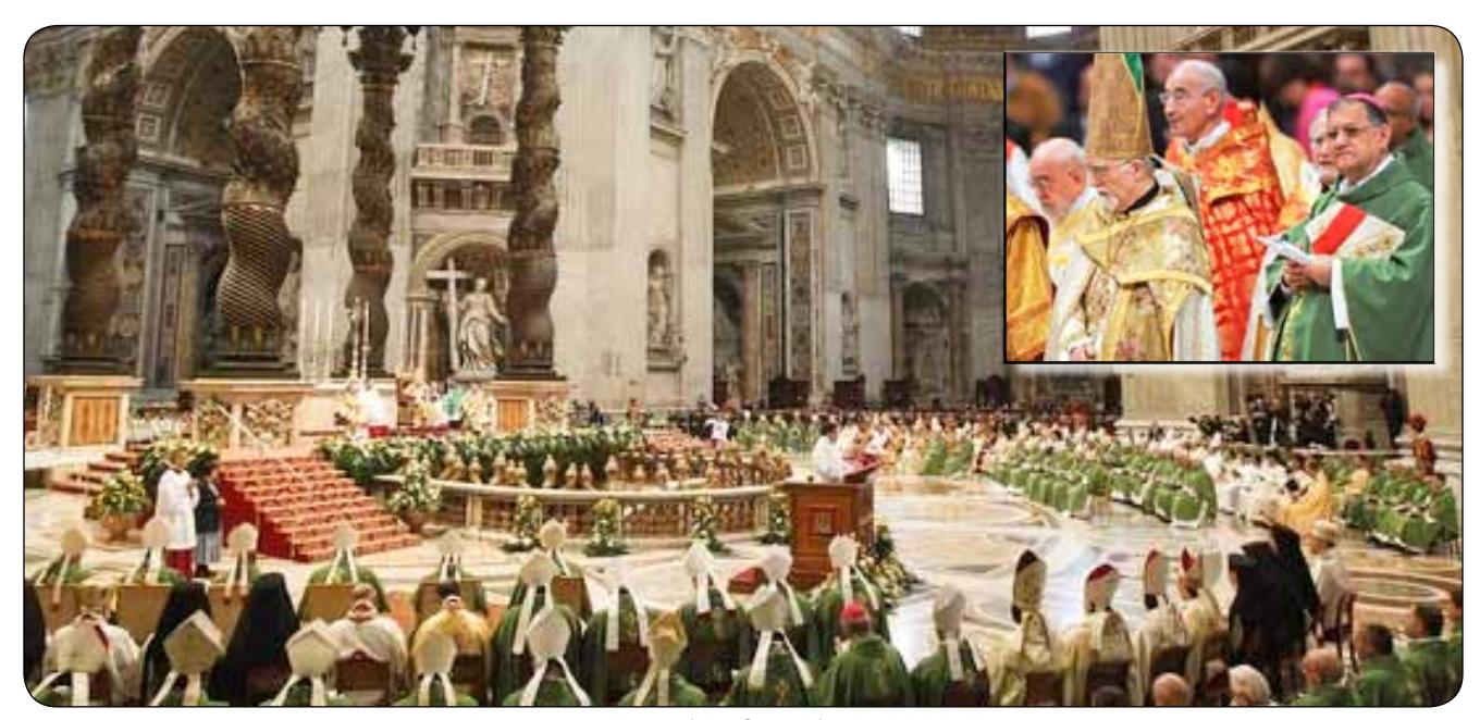
Inauguration Mass of the Synod for the Middle East