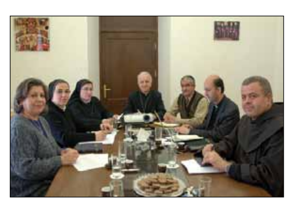
The Liturgical Committee Meets After Fifteen Years

This committee has not met since 1995. Now, Bi-